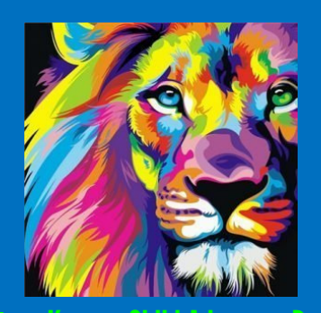
Nestern Kansas Child Advocacy Program

Parents and Children Together teaches parenting with conscious discipline.