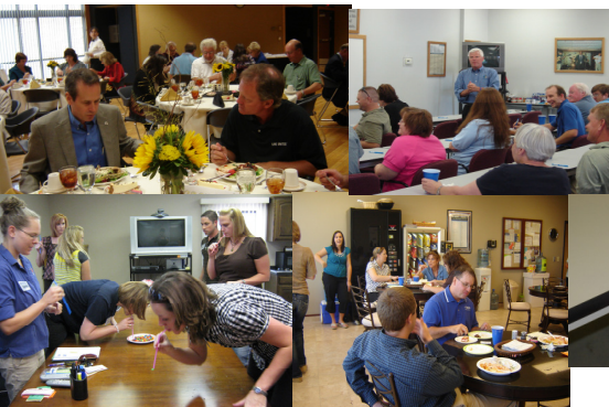
Internal Campaign Kickoff activities of Sunflower Bank, Eagle Communications, Nex-Tech Wireless and FHSU