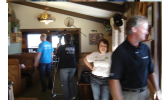
Photos L to R: Diners enjoying Dine Out Day, UW Online Auction, UW Pumpkin Packers., Montana Mike's Server Night, UW parade participants.