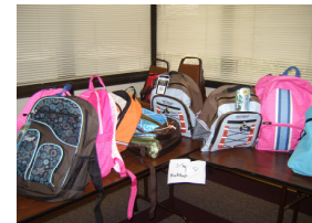
A few of the backpacks donated to First Call for Help for Backpacks for Kids

First Call for Help provided backpacks and supplies for nearly 400 area children. Western Kansas Association on Concerns of the Disabled also distributed gas vouchers to each family.